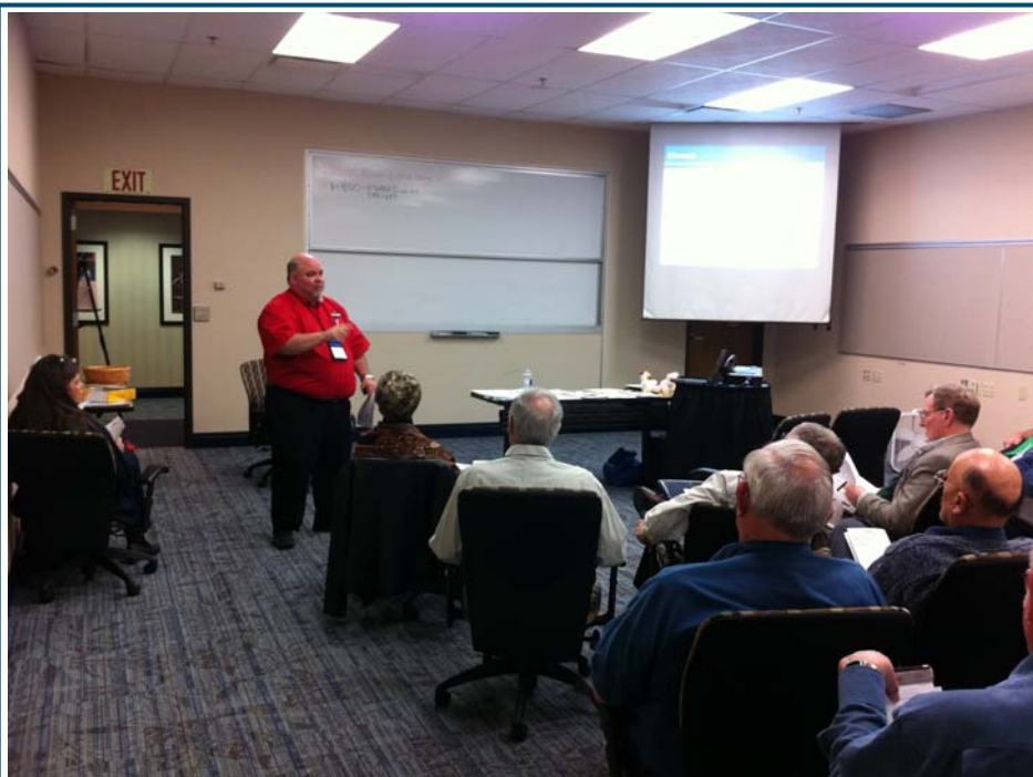
One of the sessions from the Mid-Year Education Day.